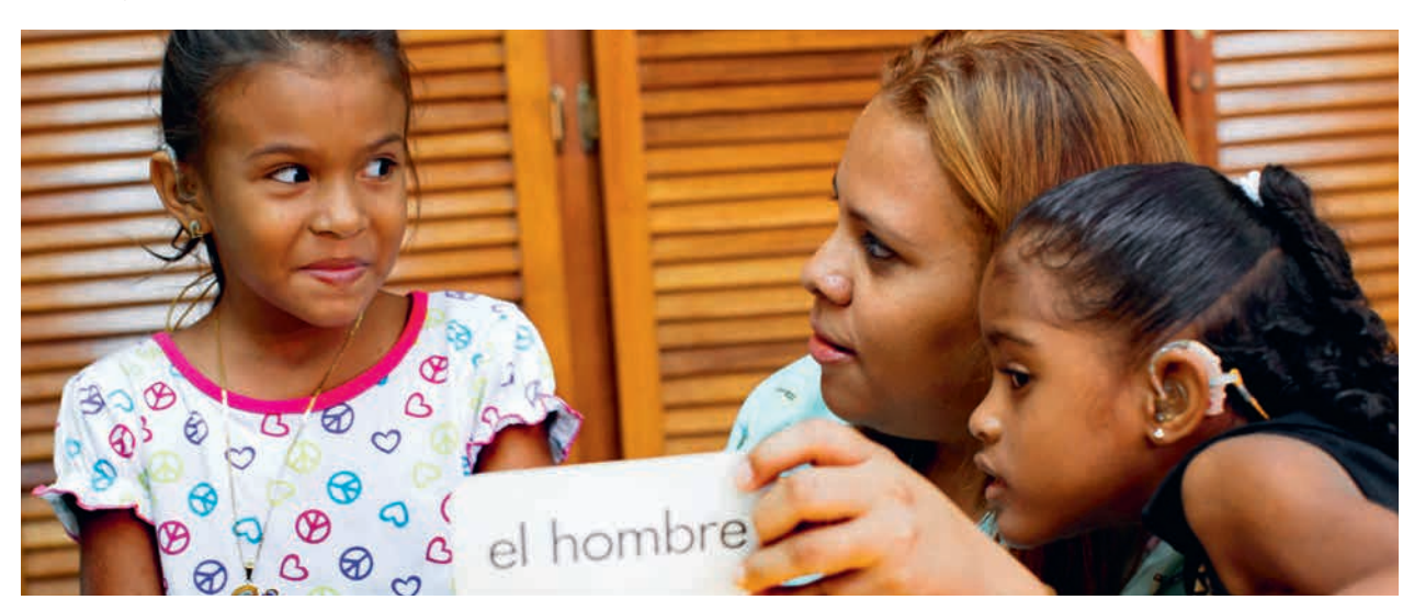
Supplementary measures, such as speech therapy, are required after the fitting of hearing aids

To help guarantee a lasting positive impact, we only provide hearing aids if we can ensure that the recipients will also receive regular support from locally based specialists after their hearing aids have been fitted. Audiological care alone is often not enough, especially in the case of children with hearing loss. Supplementary measures such as speech therapy or parental training and involvement are required to help children realize their full potential and to support their language acquisition.