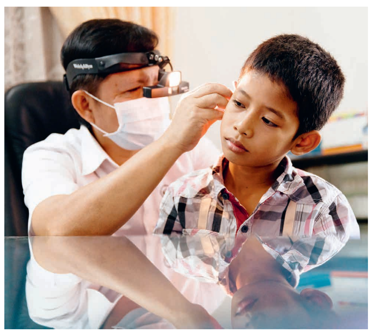
For a long-term sustainable hearing health care, it is key to ensure that there are local experts on hand

audiological care. Each of our project partners is obliged to provide a detailed report twice a year containing precise details about the progress of their project and their use of funds.